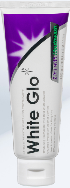
2 in 1 with mouthwash