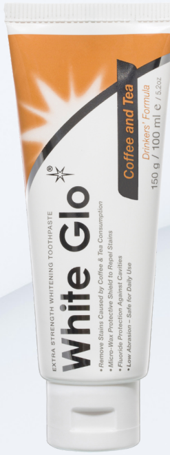
Coffee & Tea