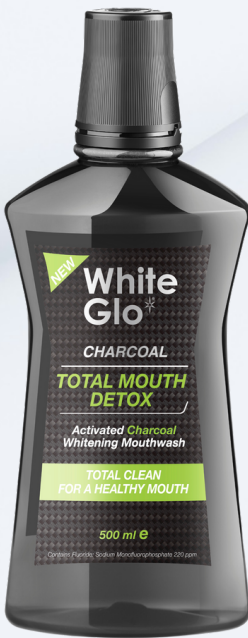
Total Mouth Detox