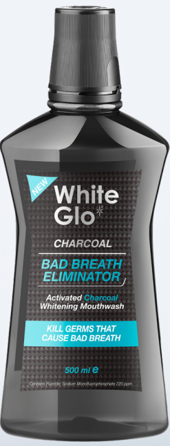
Bad Breath Eliminator