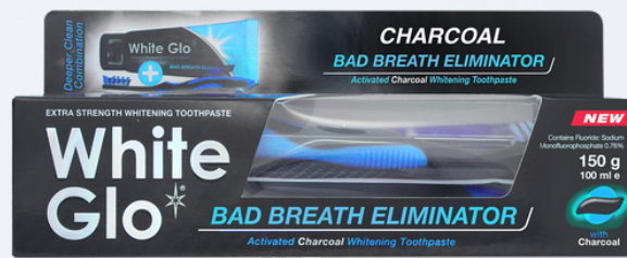
Bad Breath Eliminator