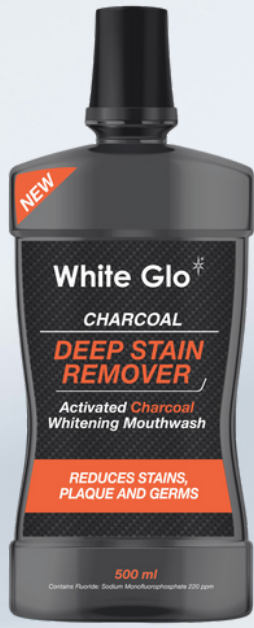
Deep Stain Remover